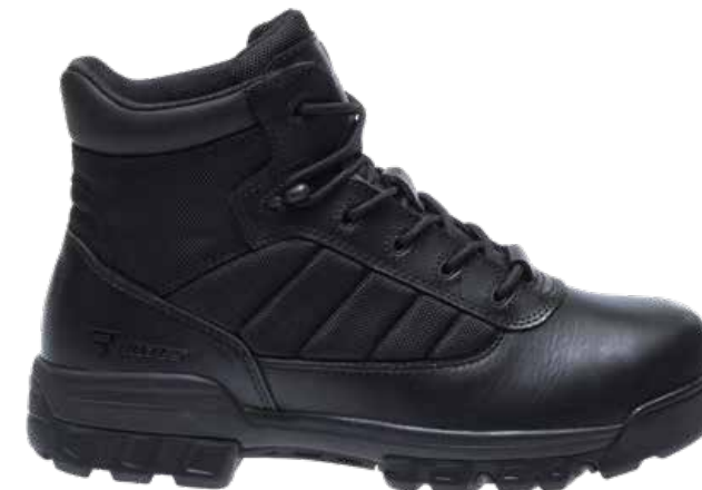
E02262 – BLACK M 40-48 Whole sizes only