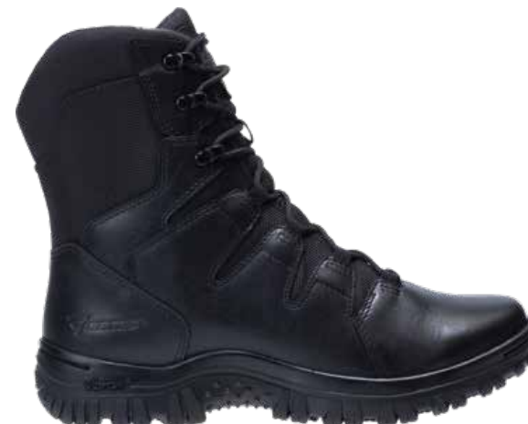
E22581EN – SIDE ZIP – BLACK M 40-48 Whole sizes only