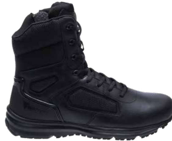
E05150EN – BLACK M 40-48 Whole sizes only