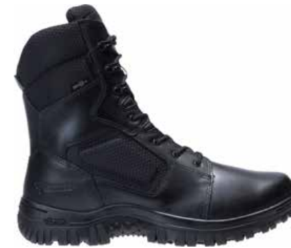
E22508EN – SIDE ZIP – BLACK M 40-48 Whole sizes only