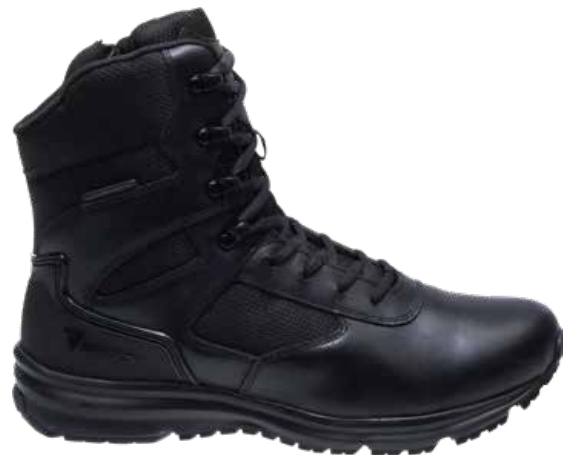
E05148EN – BLACK M 40-48 Whole sizes only