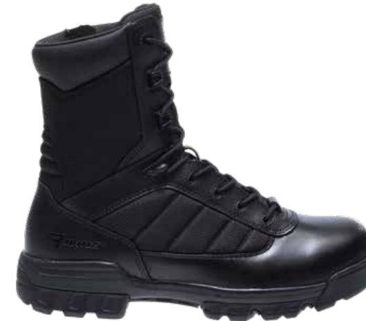
E02261 – SIDE ZIP – BLACK M 40-48 Whole sizes only