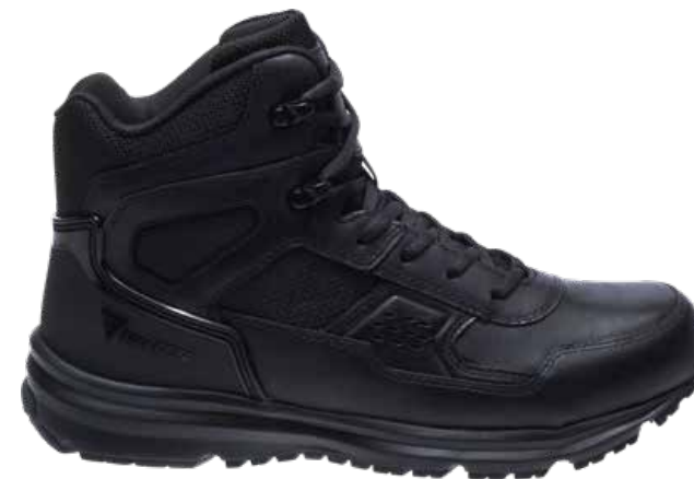
E05146EN – BLACK M 40-48 Whole sizes only