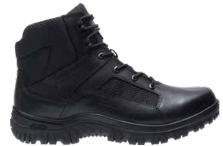
E22506EN – BLACK M 40-48 Whole sizes only